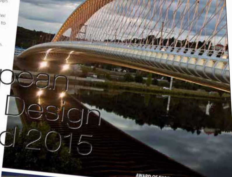
AWARD OF EXCELLENCE, BRIDGE