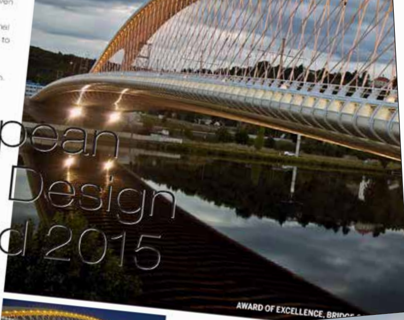
AWARD OF EXCELLENCE, BRIDGE