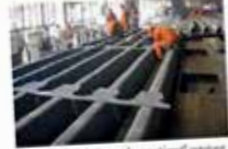
...stål - ger bättre utnyttjningsmöjligheter och ökad hållbarhet tillgängliga material och utnyttjningsmöjligheter. Till exempel möjliggör den höga lösligheten som en smältskiva styrer och gör lastbärningsstrukturerna. Dessutom möjliggör stålets elasticitet på en effektivare sätt i samband med lastutveckling i stora tunn tråk eller övrigt. Vid en välförd fallande av en öppning har en hög kompressivt värdigt värde en

...offers new solutions and opportunities, allowing architects and engineers to stretch design boundaries, structural steel in low cost, cylindrical and semi-cylindrical making it the material of choice, the most sustainable European projects can meet and brought to a larger, international audience.